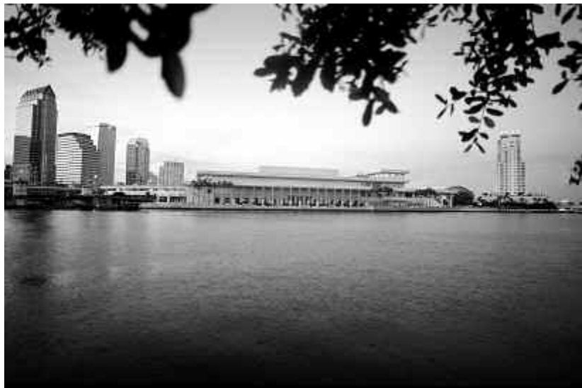
TAMPA BAY CONVENTION AND VISITORS BUREAU

Most of the newcomers to Florida in the past 20 years have settled in urban areas, with the result that over 90 percent of Floridians now live in urban settings.