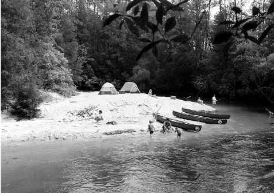
PENSACOLA CONVENTION AND VISITOR INFORMATION CENTER

Leaders must understand the consequences of regional decisions and ensure that environmental resources are sustainable for future generations.