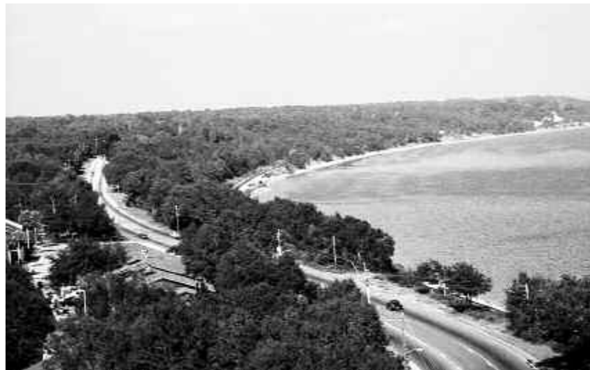
PENSA COLA CONVENTION AND VISITOR INFORMATION CENTER