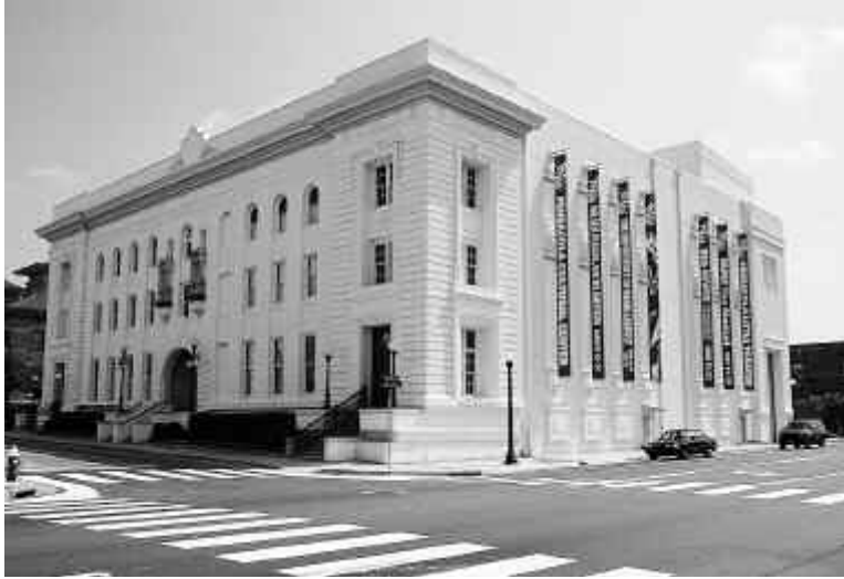
PENSACOLA CONVENTION AND VISITOR INFORMATION CENTER

Tourism is one of Florida's major economic drivers. The Pensacola Cultural Center is a downtown hub of arts and entertainment.