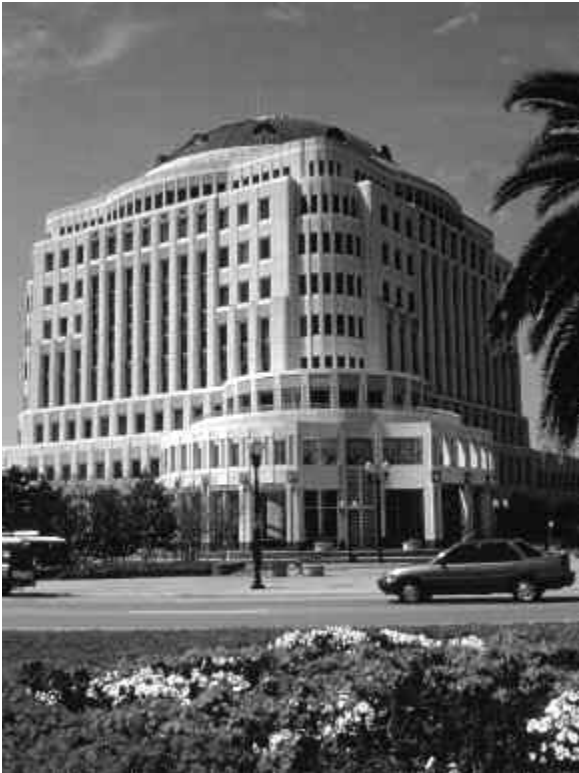
ORLANDO/ORANGE COUNTY CONVENTION & VISITORS BUREAU, INC.

Whether it is a public agency, a private organization, or a collaboration of community groups, an organization is needed by each region to be responsible for convening groups, creating opportunities for ongoing dialogue, and building trust among diverse interest groups.