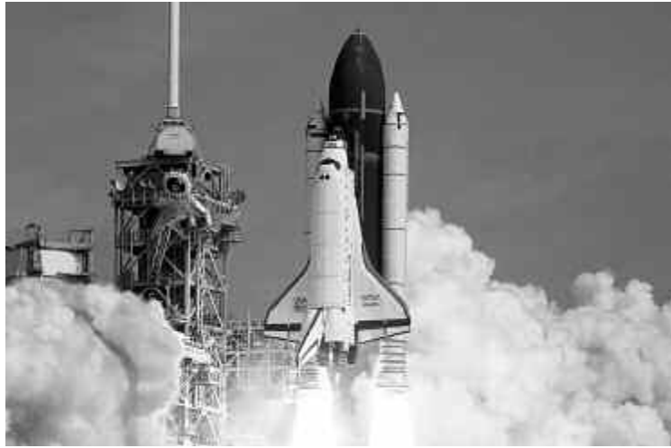
FLORIDA'S SPACE COAST OFFICE OF TOURISM

Today, Floridians live and compete in a global economy. A unified, regional approach to economic development would help to advance Florida's capacity for new aerospace-related investment.