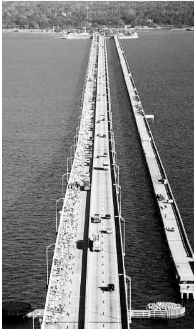
PENSACOLA CONVENTION AND VISITOR INFORMATION CENTER

The number of vehicle miles traveled annually in Florida increased by more than 250 percent between 1970 and 2000.